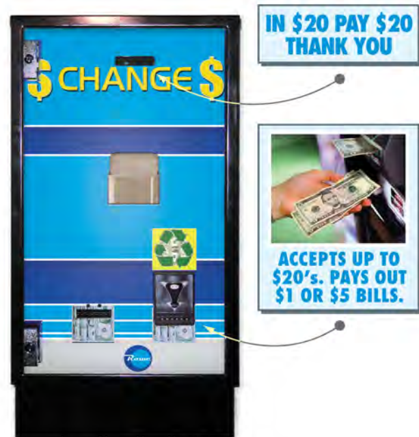
FRONT LOAD ON MOUNTING BASE